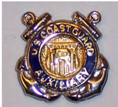
Figure 5-5 Retired Status Pin