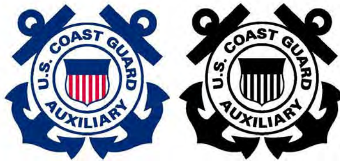
Figure 5-1 Coast Guard Auxiliary Emblem (color and black-and-white)