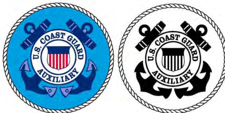
Figure 5-2 Coast Guard Auxiliary Official Seal (color and black-and-white)

The official seal may not be reproduced for any other purposes without approval by the Chief Director via the NACO or the NACO’s designated representative. If approval for use is granted and an electronic version is needed, then such version shall be obtained from the Director of the Government and Public Affairs Department (DIR-GP). The official seal shall not be included within the design of any other seal, emblem, coat-of-arms, or escutcheon.