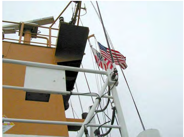
BALTIMORE, MD – A partial view of the USCGC James Rankin.